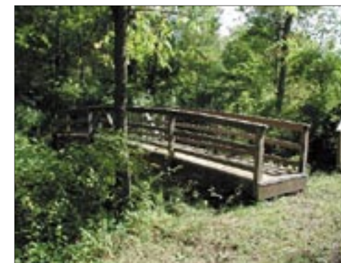
Peach Lake